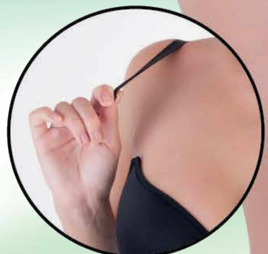
Availbale with detachable straps